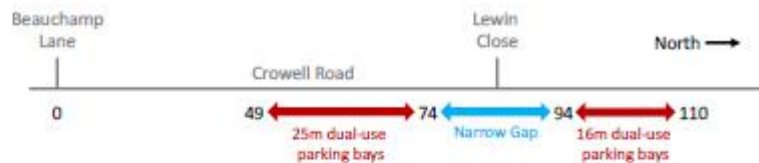
Figure 1. Schematic drawing of the location of the proposed dual-use parking bays in relation to the entrance of Lewin Close. All roads are coloured dark grey with Crowell Road running from left (South) to right (North). The north-eastern kerb line of Beauchamp Lane is marked on the left of the line representing Crowell Road. The proposed dual-use parking bays are marked in red, whilst the narrow gap with less than 3m distance from the entry to Lewin Close is marked blue.

You confirmed that “the end of the bays under the proposals would be sited 6 metres north of the centre of the access and 10 metres south of the centre of the access.” We challenge this analysis due to the provided numbers being incorrect – they are not adding up. The distance from the end of each dual-use parking bay to the closest end of the entrance to Lewin Close has also not been considered. Please refer to Figure 1 below: