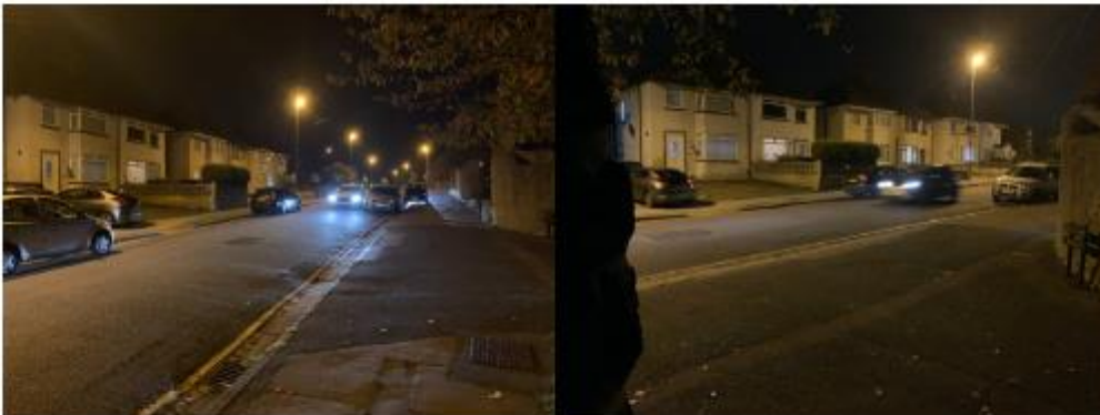
Figure 2. Typical road parking situation on Crowell Road outside the entrance to Lewin Close. Please note these photos taken at random evening hours demonstrate the traffic obstructions caused by vehicles parking on both sides of the road as well as the pavement. The second photo also clearly visualises the residents' concerns about visual obstructions.

Furthermore, the introduction of these parking bays would reduce traffic flow and increase congestion, pollution, and noise on an already very busy road: the change from overnight and Sunday parking to all-time two-hour parking is most likely to result in a significant increase parking with a high turnover of vehicles. Whilst the road is clear of parking vehicles today, the proposed dual-usage bays will narrow the usable space for passing motorists. This will result in a single lane with passing bay style traffic flow. Figure 2 illustrates these concerns.