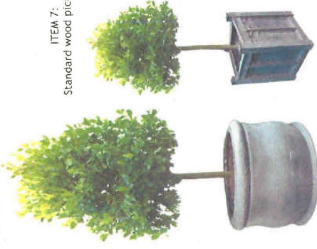
ITEMS 2, 15: Large Tree Planter ITEMS 4, 9, 10, 13 (alternate for 2 and 15): Small Tree Planter