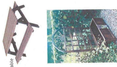
ITEM 7: Standard wood picnic table ITEM 8: Trellis-back planters