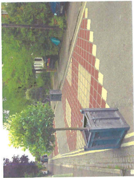
ITEMS 1, 3, 5, 11, 16, 18: Road paint pattern

BEECH CROFT ROAD PROPOSED DIY STREET PLAN DRAFT 10.3 23 MAY 2009 Refer to specification sheet for details of these DIY features Beech Croft Road, Summertown, Oxford OX2