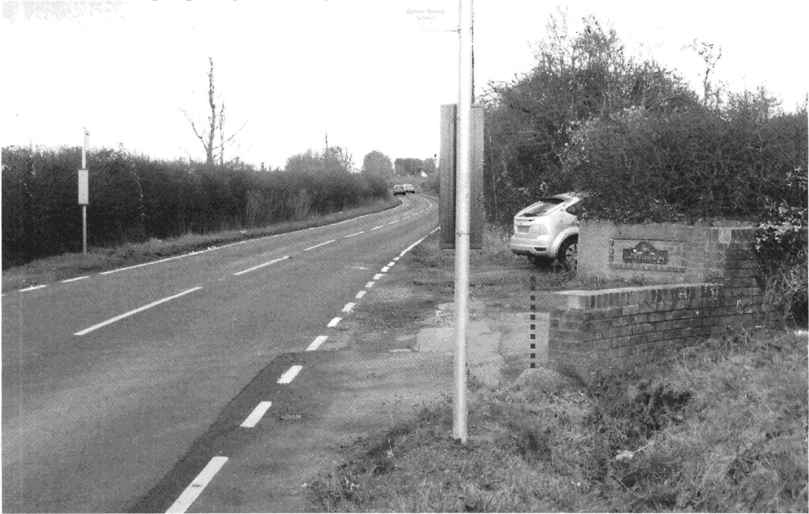
View 1 – showing highway boundary line