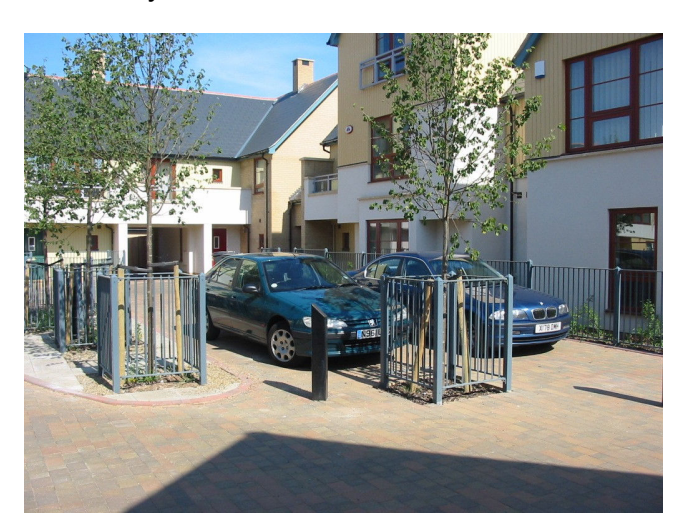
How do they get in?